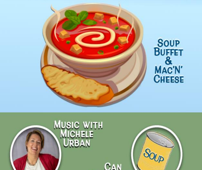
FELLOWSHIP LUNCH FOR ALL AGES

SUNDAY, FEB 9, AT 11:15 AM Parish Hall , 5 Meetinghouse Lane, Woodbridge, CT For more info: 203-936-9356